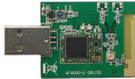
USB WiFi Module

Additionally, Embest offers various optional function modules for DevKit7000. At present, the WiFi (WF8000-U) and Digital Camera (CAM8000-D) modules are available for DevKit7000. And Embest will release more other modules in the future.