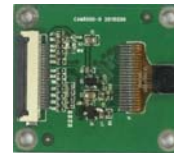
Digital Camera Module